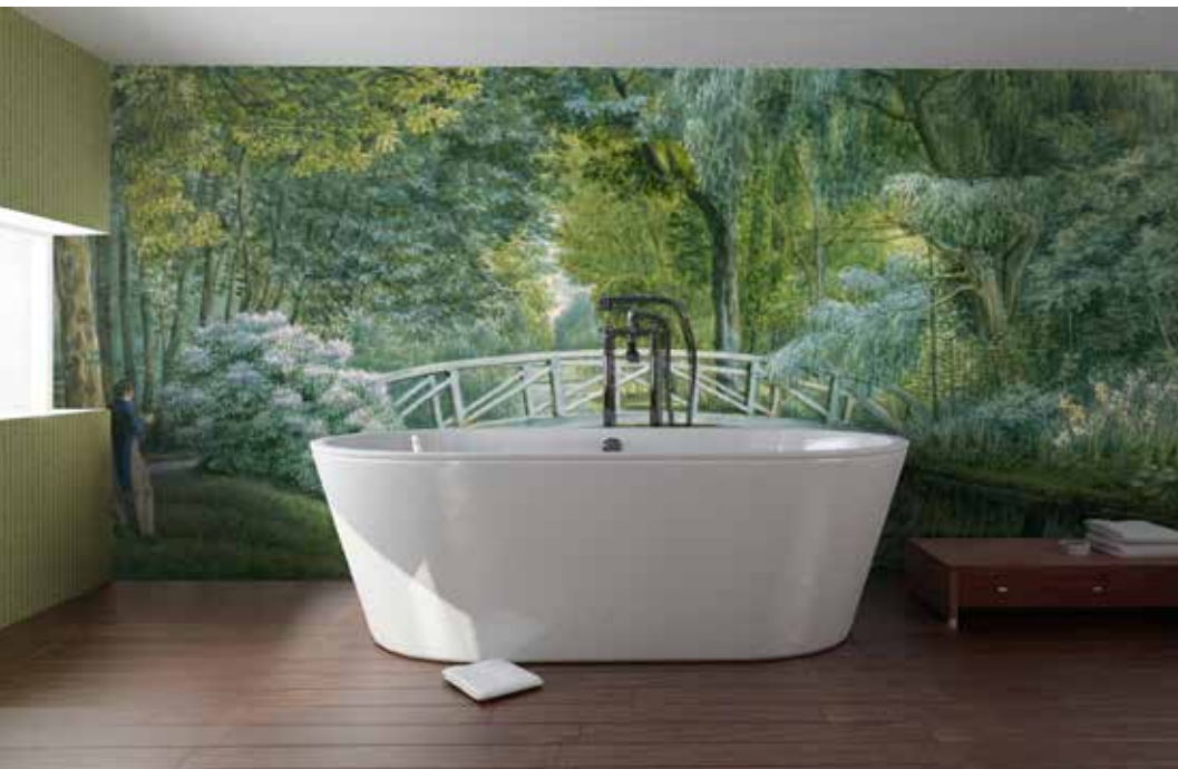
ref. BAE - Campagne anglaise XVIII ème