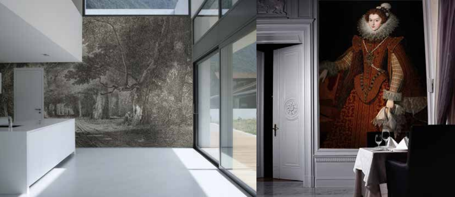
ref. Gravure ancienne - La forêt