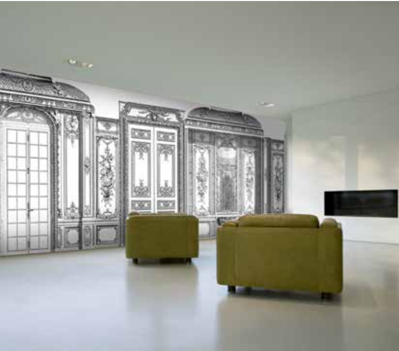
ref. BAE - Gravure - Chambre Marie Antoinette