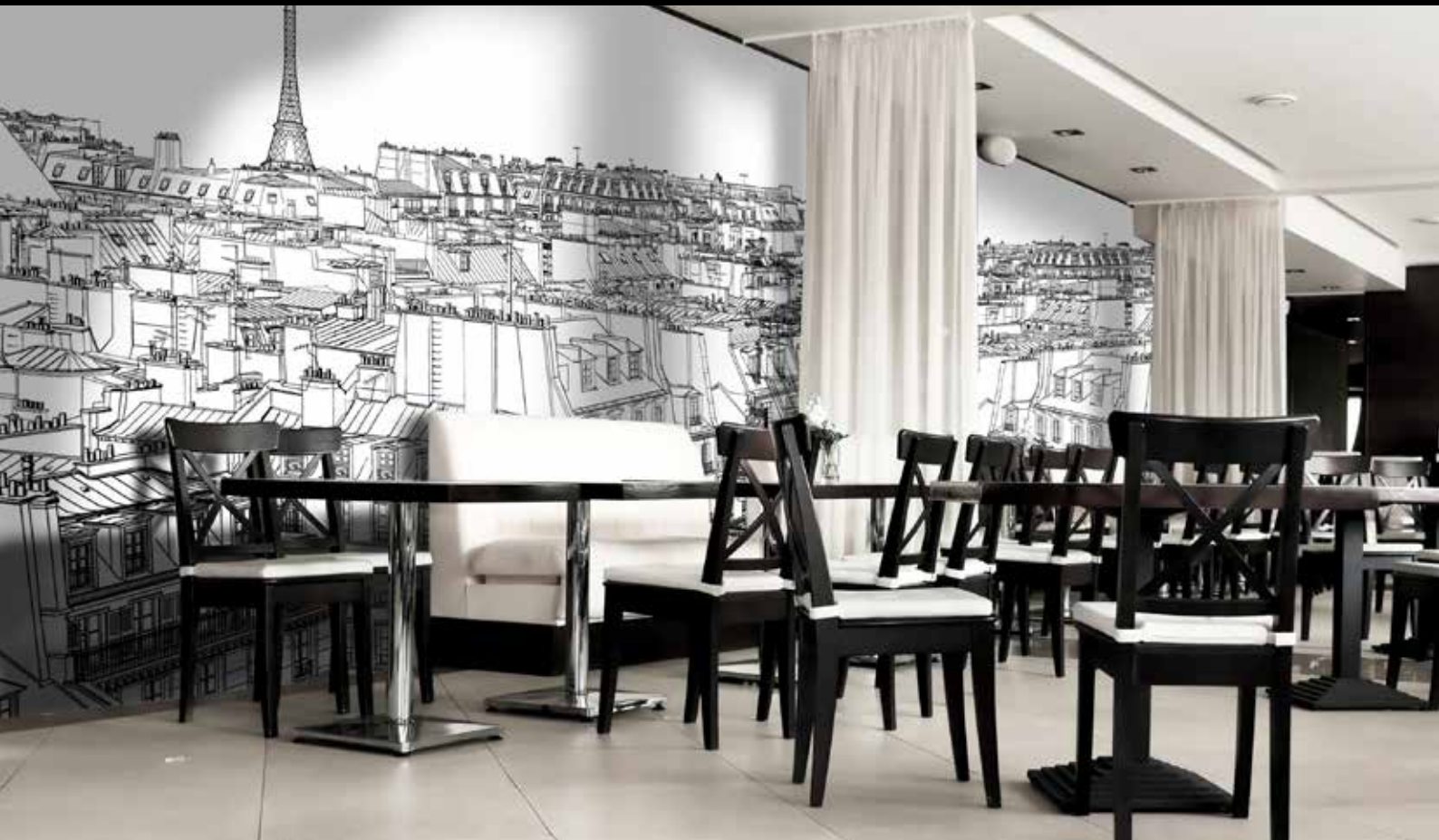
ref. City drawings - Les toits de Paris