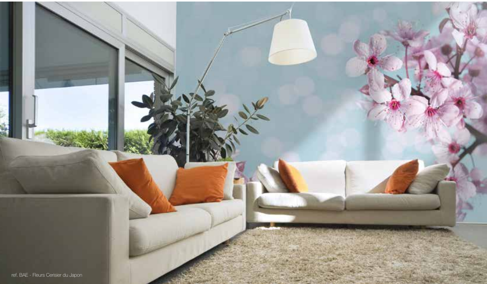
ref. BAE - Fleurs Cerisier du Japon