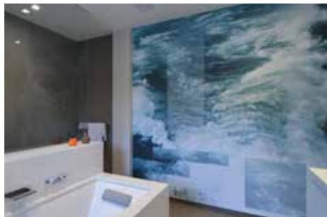
design Estrikor | Photo : Studio Rembrandt