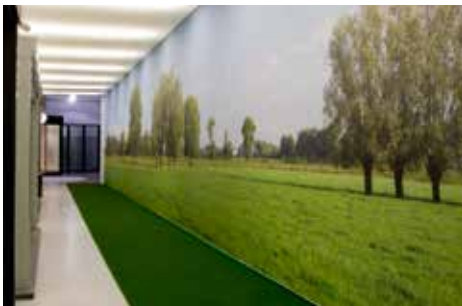
showroom Decoranda | arch. d'intérieur : Kurt Wallayes

Technical elements such as switches or electric outlets are perfectly integrated within artolis ® system.