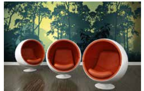
ref. Mulhousian spirit of panoramic scenery