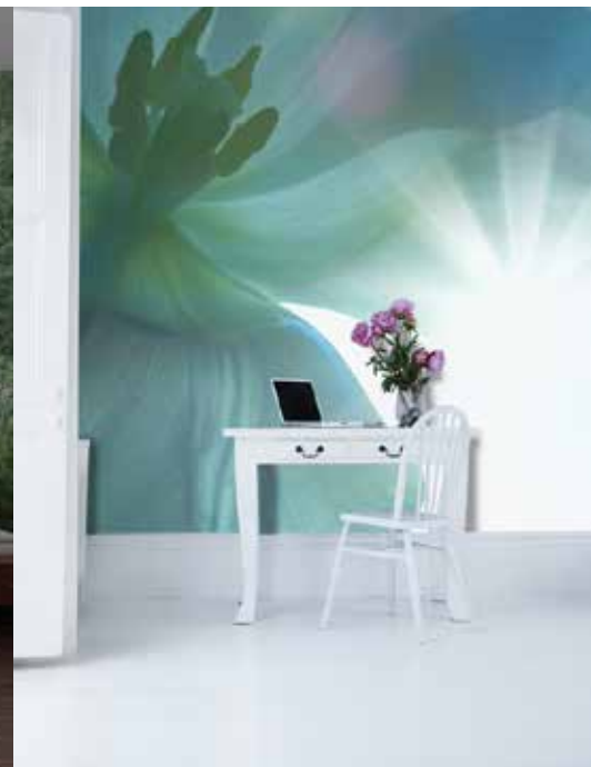
ref. BAE - Light &amp; Flower