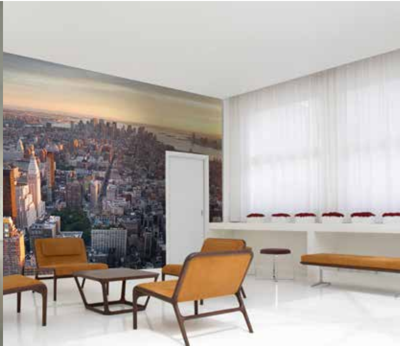
ref. Panoramique city view